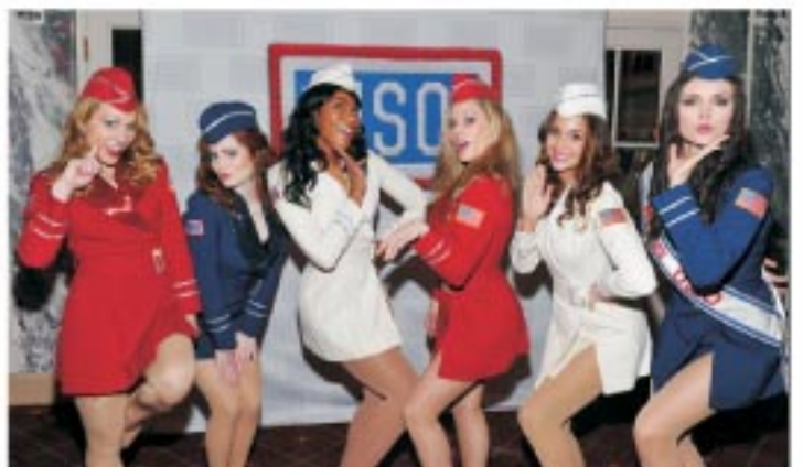
The ever popular "Liberty Belles" entertaining troops

supporting hospitality programs, career transition initiatives and family resiliency services at nine military bases and over twenty National Guard Armories and Reserve Centers in the area.