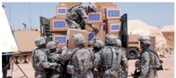
Troops reciving USO packages from home.

Through Liberty USO, you touch the lives of our military by