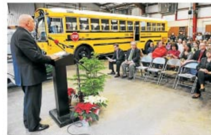
Rose Tree Media School District held a ribbon-cutting ceremony at to announce a new compressed natural gas bus fleet.

A $500,000 grant from the Pennsylvania Department of Environmental Protection Natural Gas Vehicle Development Program awarded in May 2013 was used to offset the cost associated with the first 23 vehicles, which are currently in service. The district also received a $300,000 grant from the same program in March of 2014 to apply to the cost of 12 additional busses, with an anticipated delivery in 2015.